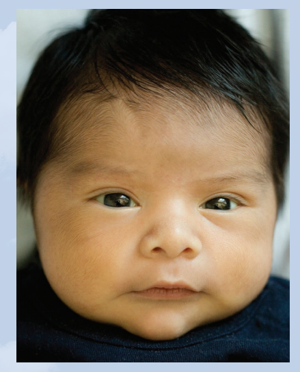
Keeping babies away from secondhand smoke lowers their chances of dying from SIDS.