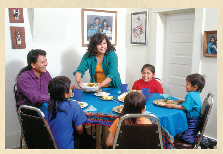
Our children are so important. Ask family and visitors not to smoke around them.

In Your Car. Do not allow anyone to smoke if children are riding in your car. Rolling down a window does not protect them.